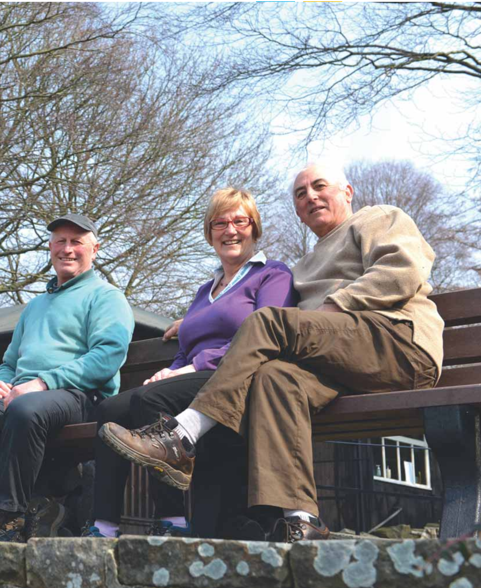
Product featured: Peak Bench