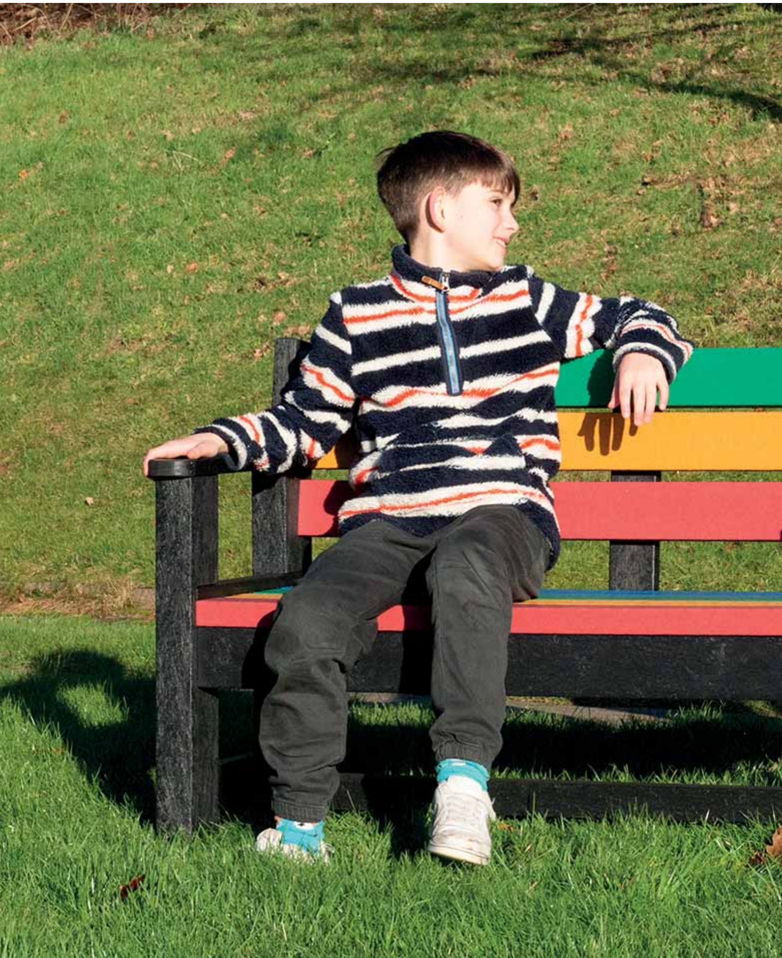
Product featured: Iguana 1.2